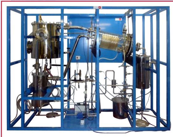
QEDC Computer Controlled Batch Solvent Extraction and Desolventising Unit