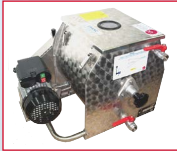
EMANC Computer Controlled Butter Maker Teaching Unit