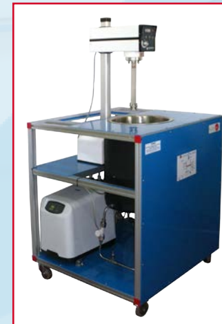
VPMC Computer Controlled Multipurpose Processing Vessel