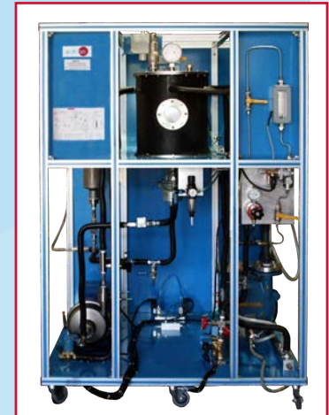
AEHC Computer Controlled Hydrogenation Unit