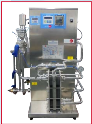
PADC Computer Controlled Teaching Autonomous Pasteurization Unit