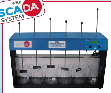
PEFC Computer Controlled Flocculation Test Unit