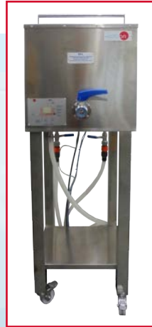
RDC Computer Controlled Teaching Cottage Cheese Maker