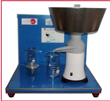
DSNC Computer Controlled Teaching Cream Separator