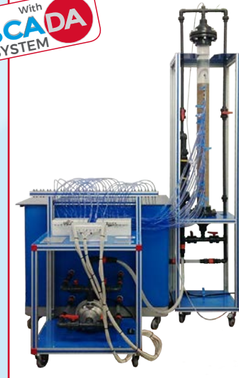
EFLPC Computer Controlled Deep Bed Filter Unit