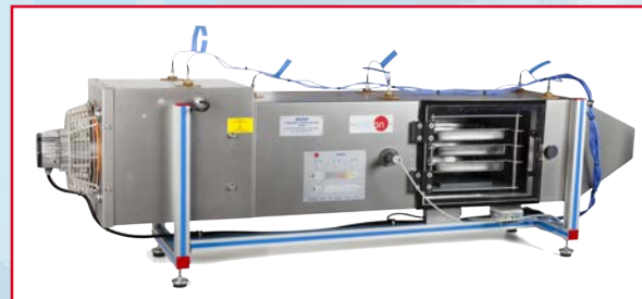
SBANC Computer Controlled Tray Drier

SAVE TIME and INCREASE TEACHING EFFICIENCY with OUR COMPUTER CONTROLLED TECHNOLOGY