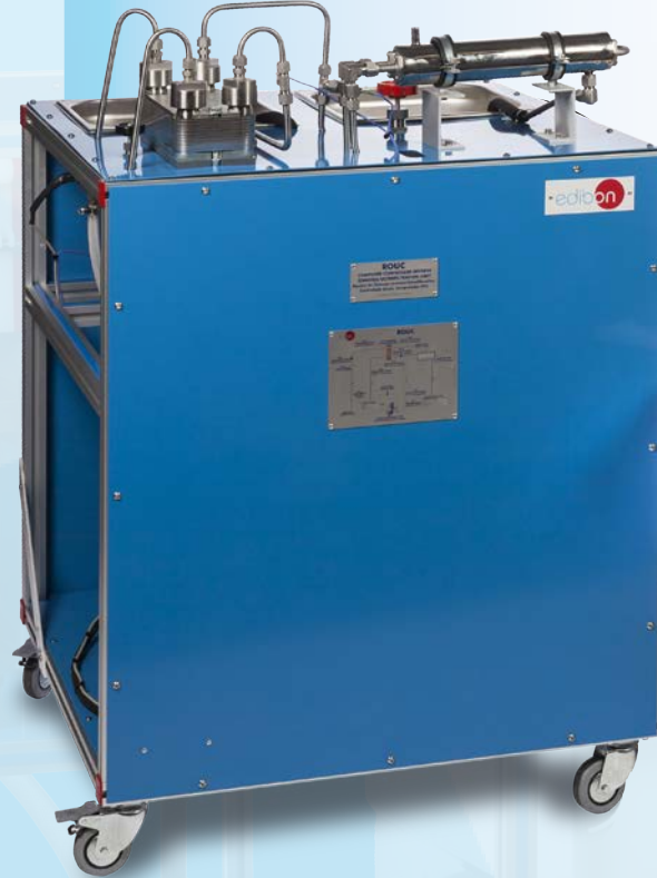
ROUC Computer Controlled Reverse Osmosis/Ultrafiltration Unit