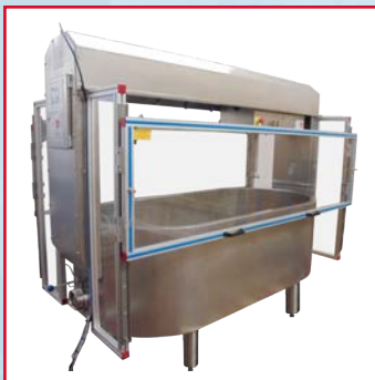
CCDC Computer Controlled Teaching Curdling Tank