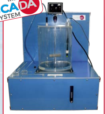
PEAIC Computer Controlled Aeration Unit