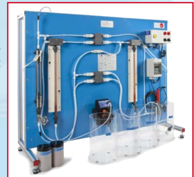
EII Ion Exchange Unit