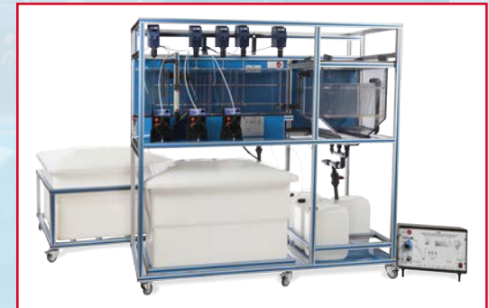
SPFB Sedimentation, Precipitation and Flocculation Unit