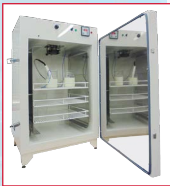
IYDC Computer Controlled Teaching Yogurt Incubator