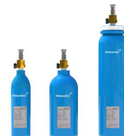
MHS 200 Art.-Nr. K00-0648 MHS 400 Art.-Nr. K00-0649 MHS 800 Art.-Nr. K00-0650

An integrated quick coupling allows an easy and safe connection to an individual hydrogen source. The storage is equipped with a pressure and temperature relief valve to avoid dangerous conditions.